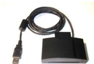
Service Card Reader